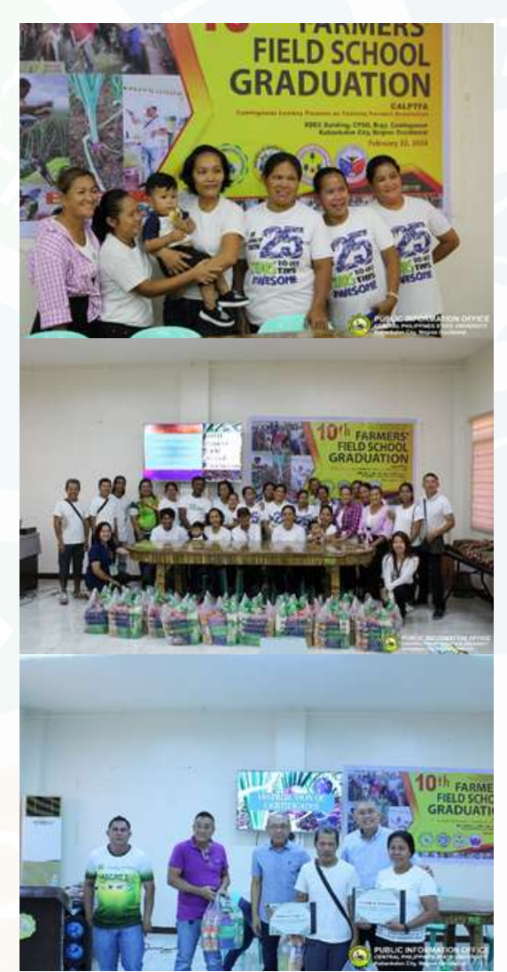
10th Batch of Local Farmers Complete FFS Program

The tenth commencement ceremony for Central Philippines State University's (CPSU) Farmers' Field School (FFS) for Camingawan Lumboy Pinamus-an Tamlang Farmers Association (CALPTFA) transpired last January 22, 2024, at CPSU Main Campus.